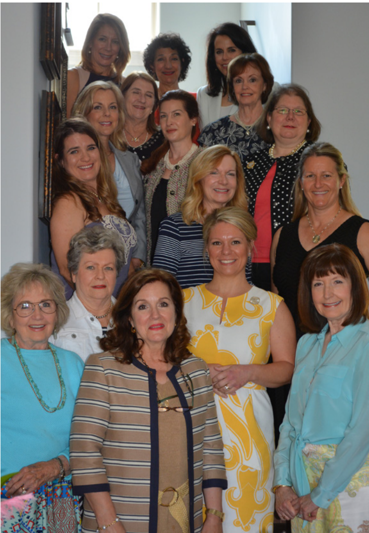
Junior League of Lafayette Past Presidents