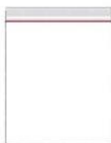
STORAGE BAG: 1 GALLON CLEAR STORAGE BAG