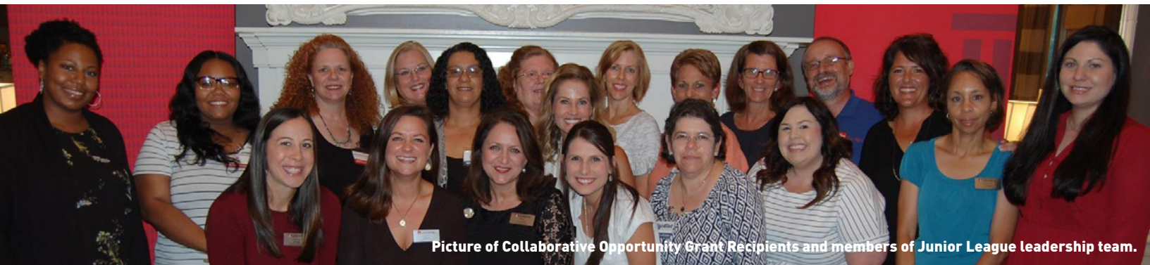
Picture of Collaborative Opportunity Grant Recipients and members of Junior League leadership team.

Junior League of Lafayette members will assist the mentoring program with their Girl's Night twice during the year. The Girl's Night will consist of a meal and other activities with female community members who will discuss topics that have been previously submitted by students. The goal of the night is to provide the female students with encouragement and empowerment as they develop into adults.