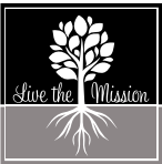
JUNIOR LEAGUE OF LAFAYETTE PRESIDENT 2014–2015